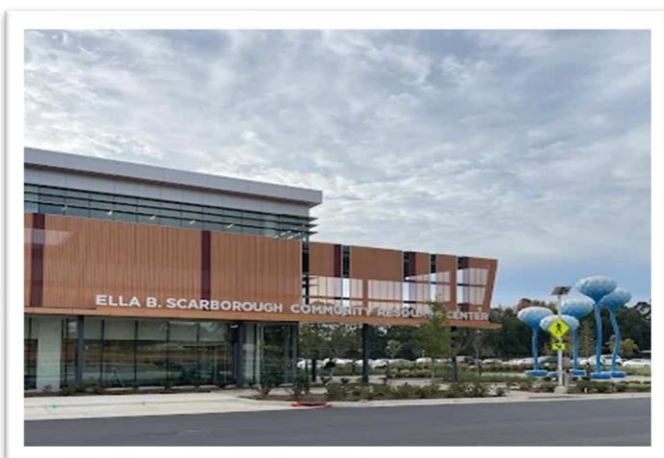
Ella B. Scarborough Community Resource Center